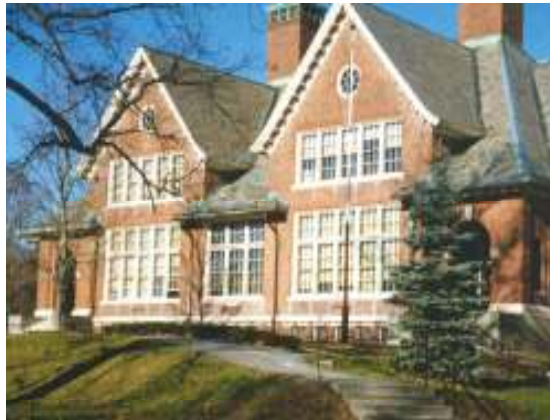
Northbridge Middle School "Believe and Achieve"